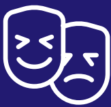
Valorisation of cultural heritage & traditions