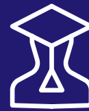
Access to (quality) education, incl. education for environmental sustainability and digitalization